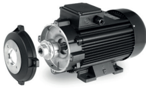
Motor with elastic joint